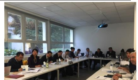
FRANCE – BRIEFING OF THE DELEGATIONS

The representatives from NDRC central bodies continued their mission on 1 November to Germany, where they held discussions with the Rhein-Bonn-Sieg University concerning the organisation of a training course in 2017 under Component 1 programme of activities.