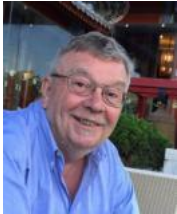
FROM THE RESIDENT EXPERT, COMPONENT 1

Social Protection Reform Project 中国-欧盟社会保障改革项目