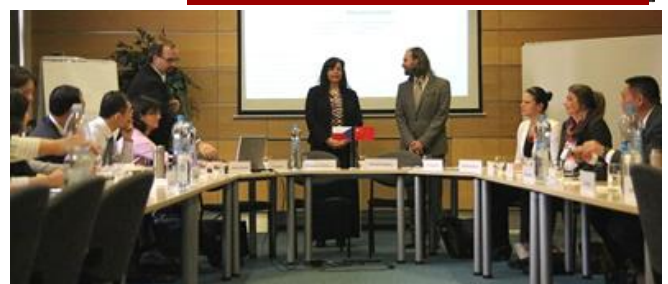
PRAGUE – MINISTER MS MARKSOVA MEETS WITH THE DELEGATIONS