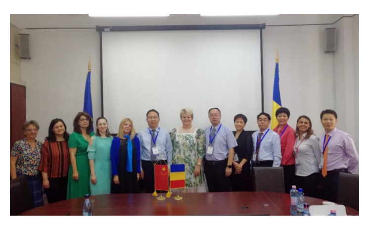
Romania, National Agency for Payments and Social Inspection (NAPSI)