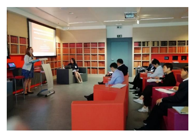
Belgium, Federal Public Service Social Security

In Brussels, the delegation was received by the Federal Public Service Social Security, where they had an exchange on: 1) the challenges of social security financing, addressing the topics of sustainability of pensions in the context of demographic ageing and modeling the long-term sustainability of social protection; 2) social security financing in Belgium, discussing the topics of managing the collection of mandatory social security contributions in Belgium and social security compliance and fraud.