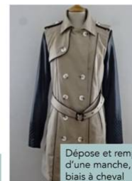
Dépose et remplacement d'une manche, pose de biais à cheval