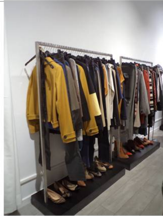
SAME SPACE AFTERWARDS