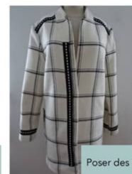
Poser des galons