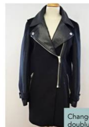
Changer une doublure