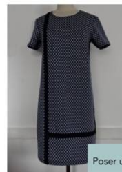
Poser un biais à plat