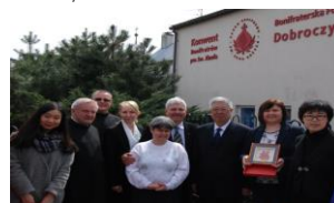
Field visit (Malopolska-Poland): MoCA delegation visiting Konary center (Social Assistance Center, Occupational Therapy Center, Crisis Intervention Center)