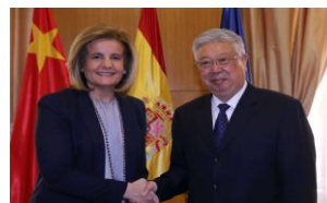
Ms Fátima Báñez, Minister of Employment and Social Security of Spain and Mr Li Ligu, Minister of Civil Affairs P.R.China